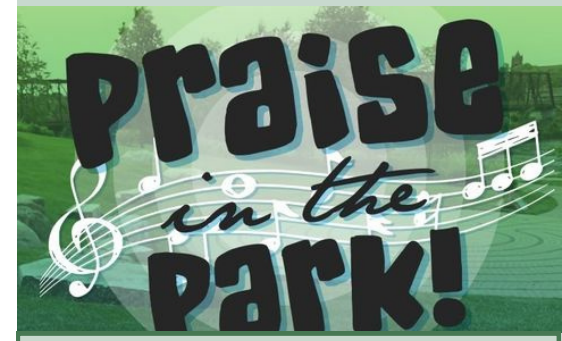
PRAISE IN THE PARK RETURNS SUMMER 2024

The knitters of Immanuel have completed another very productive session to support our neighbors in need. Between October 2023 and March 2024 this group has created 223 items, such as hats, scarves, cowls, mittens etc. In addition, 56 items were sold at a fundraiser to benefit the youth group traveling to the ELCA Youth Gathering. That brings the total to 279! Wow! What a wonderful effort! This year we have also received several large donations from members. Many thanks for all your contributions and amazing work. Distribution points were: our food pantry, Community Table, Helping Hands & Community Haven House Warming Center. They were all very grateful for these lovingly made gifts. We are on summer break for the Community Project; as we did last year, we will work on our own projects in the next few months, meeting at private homes. The first meeting will be at my house on May 6 from 1-3 pm. Subsequent meetings will be decided at that time. They may be somewhat less frequent, so please check with me, since the location may change. I'm looking forward to working with you on knitting, crocheting, tatting or other needle work. We help each other when we encounter a speed bump. Mostly, we have a lot of fun while we learn.